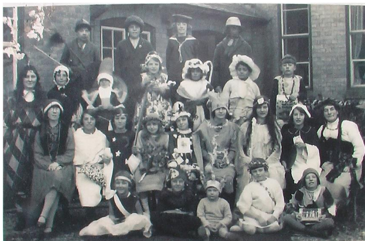
Christmas Fancy Dress party, Childerley Gate School in 1929/30. The school buildings can be seen in the background.

recollections of the teachers, and the lessons they attended. But with exception of one photograph taken in about 1930, in which the school buildings can be glimpsed behind a group of pupils, we have no idea what the school buildings looked like.