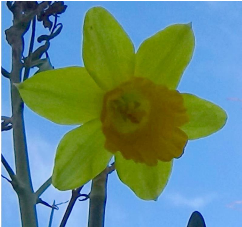
Another very early bulb in flower. On 20 December 2018