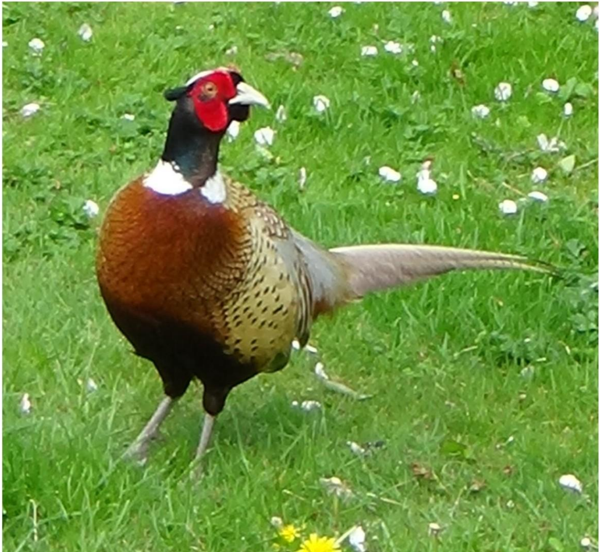
MR Pleasant Pheasant our garden visitor