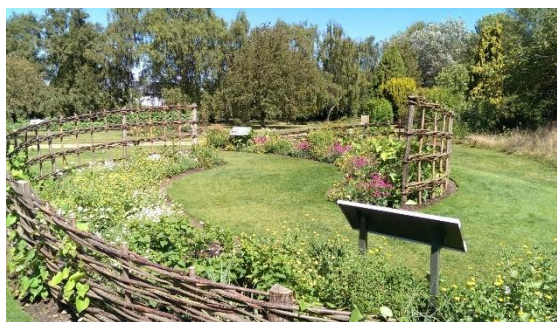
Circadian rhythm beds.