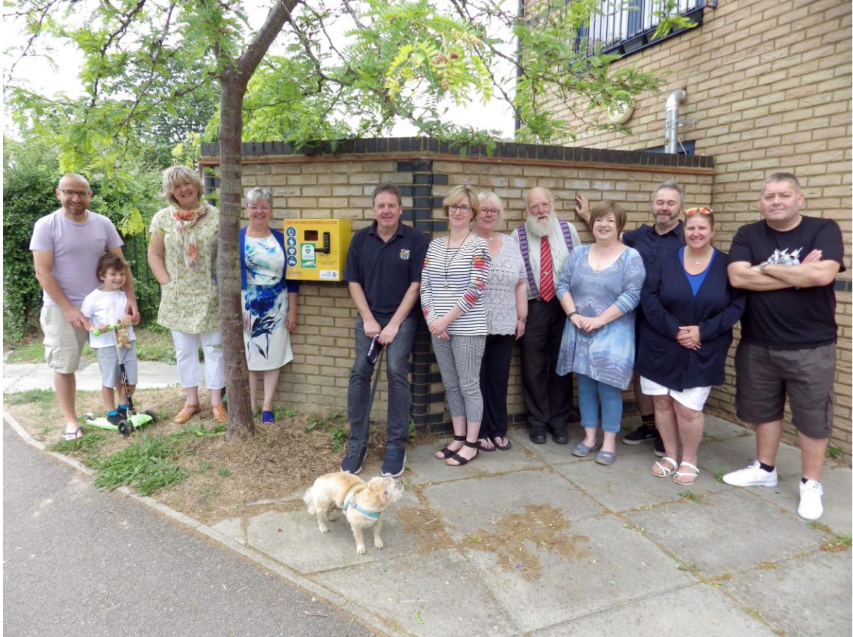
Defibrillator located on FURLONG WAY, at the side of the shops at School Court