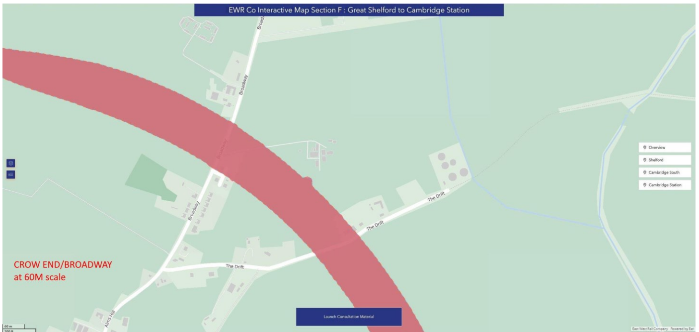
Figure 2 Route of Alignments 2,6 & 8 through the Broadway at Bourn